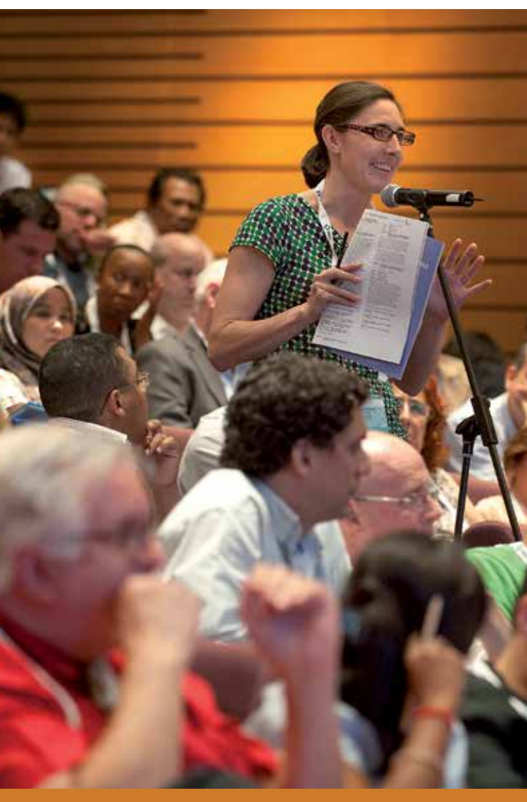
Audience at IAS 2013.

In a separate presentation, Price reported findings from 40 narrative interviews with VMMC clients aimed at understanding the process men go through when deciding to become circumcised and when seeking the procedure. (56) Men were asked to narrate their stories from the time they first became aware of the availability of VMMC to the day of their interview at the VMMC clinic. Of note, personal networks were found to play an important role at each stage of the behavior change process; female partners, friends and family members were the most influential members of these networks.