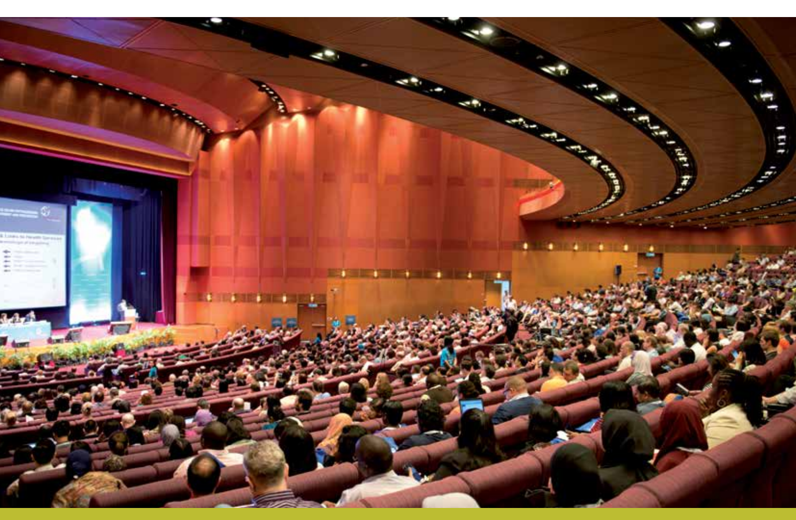
Audience at the IAS 2013 Monday Plenary Session

were offered HIV counselling and testing and HIV-positive women began an efavirenz-based regimen. Monthly follow-up continued until I year after delivery, when women were referred to a regular outpatient clinic. Acceptance of HIV testing was greater than 99% and seroprevalence was 14%. By the end of March 2013, 1691 pregnant women and 207 lactating women had started ART, with 767 already on ART prior to pregnancy. Retention at six months was 70%, lower than the 82% national average however the researchers argued that this was in part artifact. Among women who remained in care, 96% had an undetectable viral load at 6 months or beyond. Among 1034 infants tested by polymerase chain reaction (PCR) for HIV to date, only 22 (2.1%) had HIV infection. The researchers concluded that Option B+ for antiretroviral prevention of mother-to-child transmission of HIV proved highly successful virologically however psychosocial support is needed to reduce early defaulting particularly after the first antenatal clinic visit.