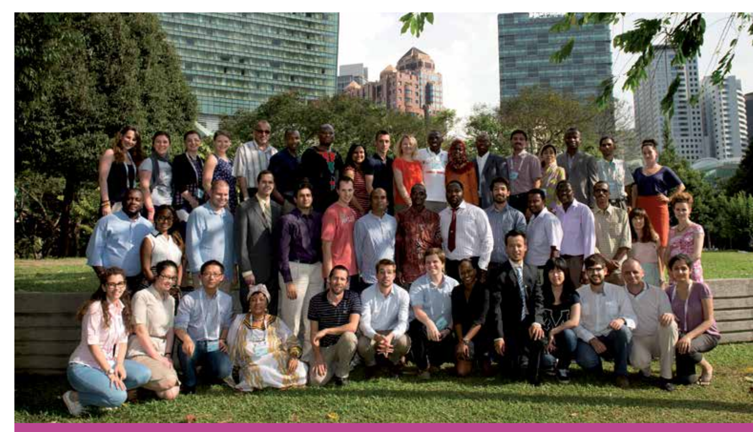
IAS 2013 International and Media Scholarship recipients.

even in patients with a high CD4 count, to promote optimal CD4 T-cell reconstitution and limit the size of the latently HIV-infected PBMC reservoir.