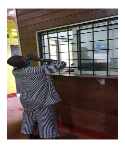
Methadone Dispensing at Shimo La Tewa Methadone clinic