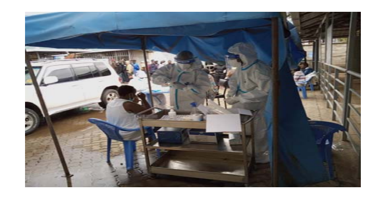
Testing of PWIDs at Ngara MAT Clinic Nairobi