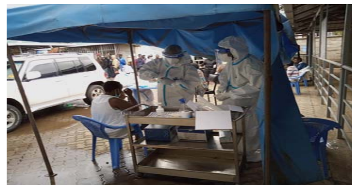
Testing of PWIDs at Ngara MAT Clinic Nairobi