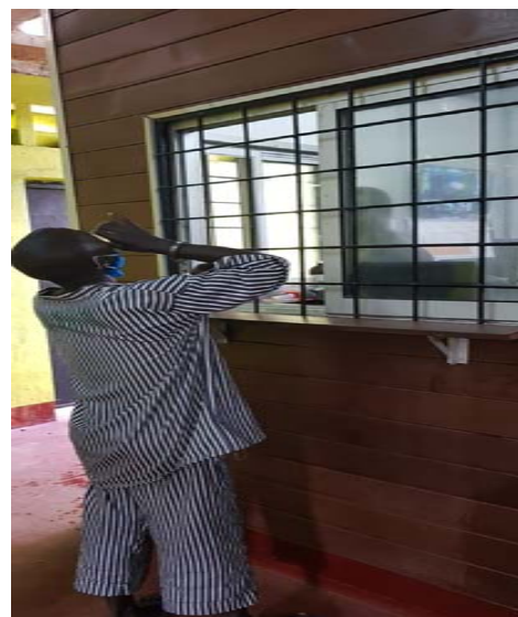
Methadone Dispensing at Shimo La Tewa Methadone clinic